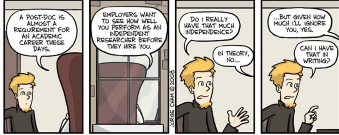
WWW. PHDCOMICS. COM

A good postdoc gets involved in many opportunities, is delegated a lot of responsibility and contributes significantly to shaping the projects at IAMT. This also means giving a lot of feedback to students and no longer just being friend and peer but becoming 'boss' and this takes a bit of getting used to. Demands on time get rapidly more and soon the ability to prioritize and manage the many opportunities and responsibilities will determine success.