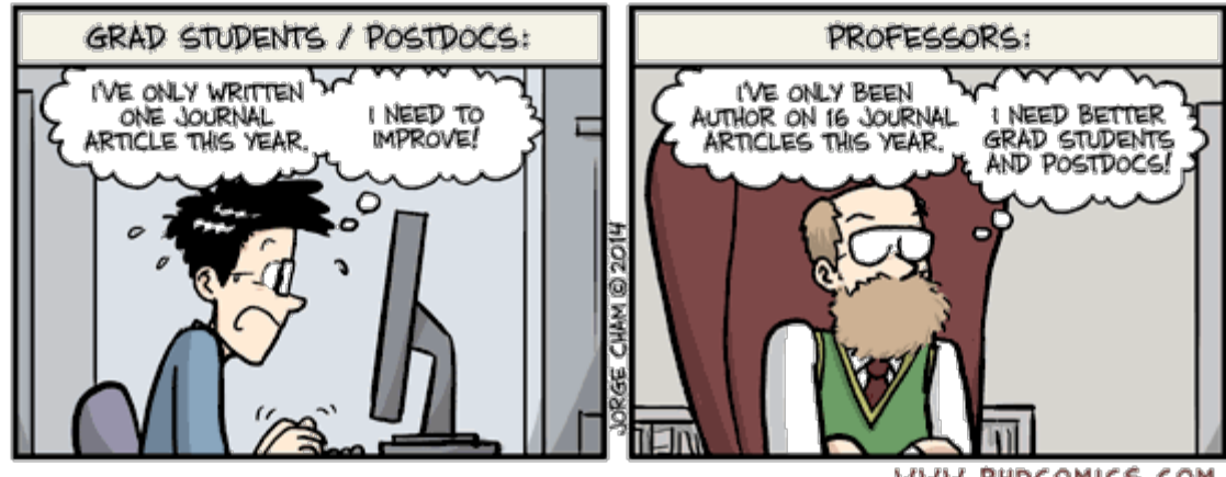
WWW. PHDCOMICS. COM

A PostDoc is expected to work more independently and after an initial period of learning the ropes of IAMT will very actively supervise her/himself a growing team. This will normally start with master students and at some point, include the contribution to PhD supervision. The 'supervisor' is now much more a colleague and collaborator who offers guidance but with much more focus on enabling the career than teaching basic skills.